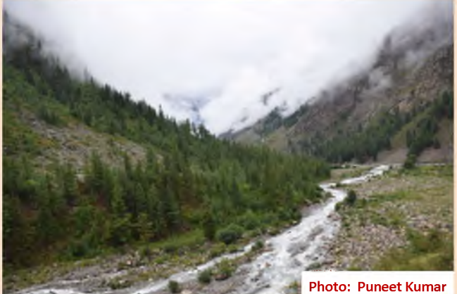
A view of vegetation around Jambu Nalla in Sechu Tuan Nalla WLS, Chamba, Himachal Pradesh

Identified total 67 species and made descriptions for 92 species of plants under the projects on Flora of Uttarakhand Vol. V; Floristic Diversity and Phytosociological study of Simbalbara National Park; Flora of Nandhour Wildlife Sanctuary; Flora of Sonanadi Wildlife Sanctuary; Flora of Sechu-Tuan Nala Wildlife Sanctuary, Himachal Pradesh; Trees of Dehradun city and its vicinity; Revision of family Cyatheaceae and genus Adiantum in India.