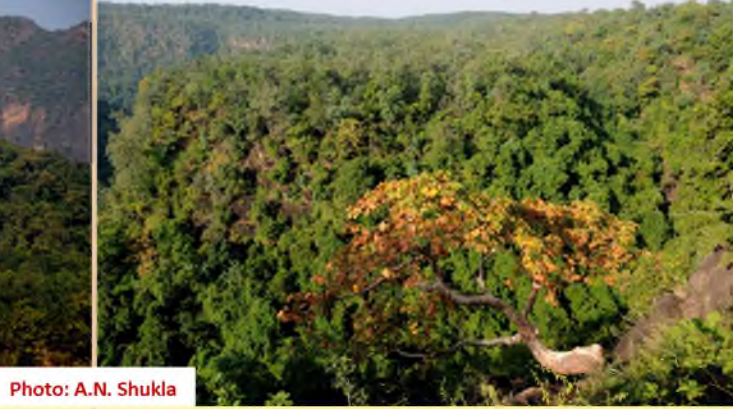
A view of Forest at Bori Reserve, Pachmarhi