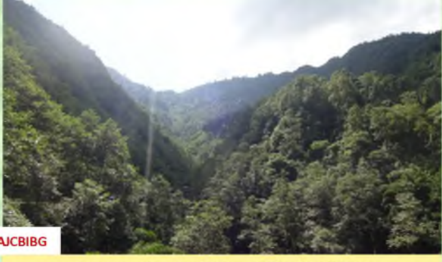
Temperate vegetation of North Sikkim