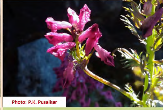
Corydalis violacea (Papaveraceae) - a threatened narrow range Western Himalayan Endemic