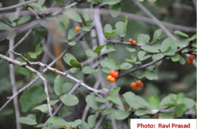
Fruits of Grewia tenax (Malvaceae)