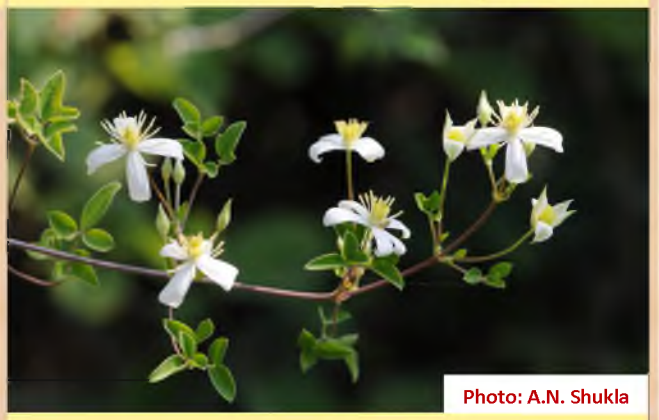
Clematis triloba (Ranunculaceae) in bloom at Pachmarhi

Taxonomic description of 45 species: 29 species for 'Flora of Chhattisgarh Vol. II'; eight species for 'Flora of Parvati Aranga Wildlife Sanctuary and adjacent Tikri forest area, Gonda, UP'; eight species for 'Flora of Chandraprabha Wildlife Sanctuary, Chandauli, U.P. were completed.