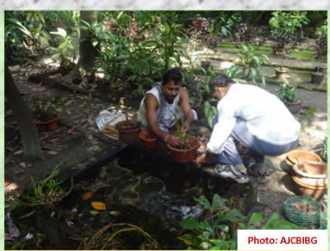
Potting of orchids at Nursery I

Scientists and scientific staff of AJCBIBG participated as members of various committees formed for two-day seminar and exhibition on "Joseph Hooker: Botanical Trailblazer and Botanical Heritage of India" organized by BSI in collaboration with University of