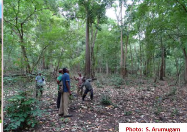
Collection at Pulichakadu, Cudalore, Tamil Nadu