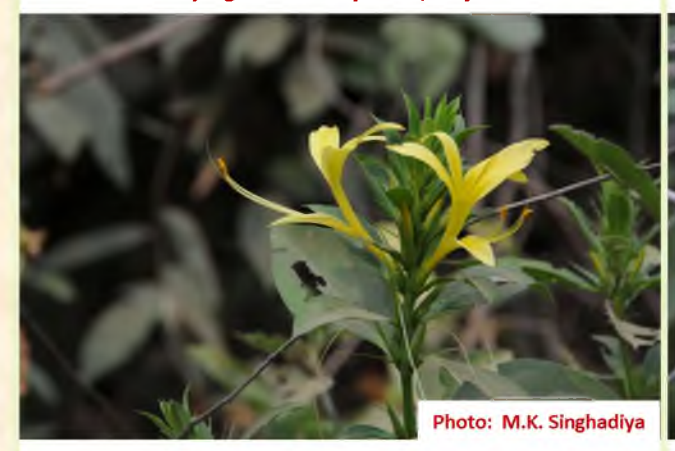
Barleria prionitis var. dicantha (Acanthaceae)