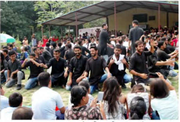
नुक्कड़ नाटक प्रस्तुत करते अस्मिता थिएटर ग्रुप के युवा।

नोएडा (ब्यूरो)। सेक्टर-37 स्थित बॉटिनिक गार्डन ऑफ इंडिया रिपब्लिक (बॉटिनिक गार्डन) में दो से आठ अक्तूबर तक वन्य जीव सप्ताह मनाया जा रहा है। बृहस्पतिवार को गार्डन में विभिन्न स्कूलों व कॉलेजों के 450 से ज्यादा विद्यार्थियों ने हिस्सा लिया। उन्हें पेड़ पौधों के बारे में जानकारी दी गई। इसके साथ ही भविष्य में वृक्षों की बढ़ती किस्म व भूमिका के बारे में भी बताया गया। कार्यक्रम के अंत में अस्मिता थिएटर ग्रुप के ने पर्यावरण के मुद्दे पर एक नुक्कड़ नाटक प्रस्तुत किया, जिसमें पेड़ों के महत्व को समझाया गया।