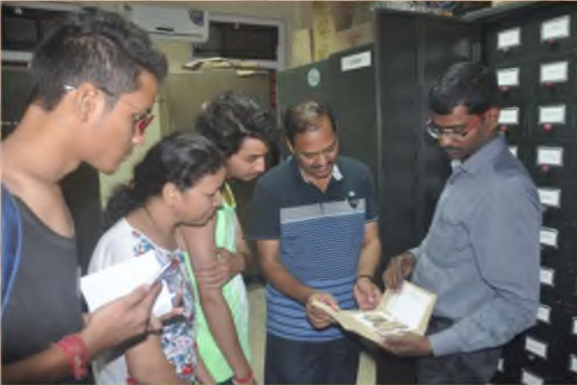
Visitors at Museum and Herbarium (Lichen section) at ANRC, Port Blair