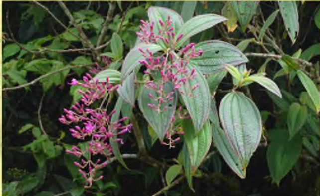
Oxyspora paniculata (Melastomataceae)